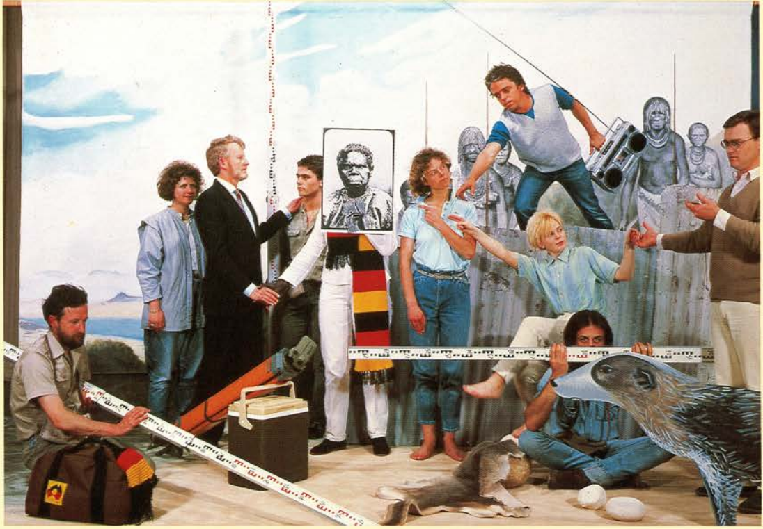
Geoff Parr, The National Picture, 1985, Nekko print on canvas.

J. W. POWER COLLECTION MUSEUM OF CONTEMPORARY ART, SYDNEY